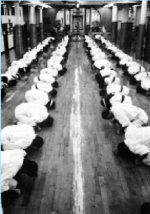
Typical scene in the traditional Jpanses Dojo which demonstrates the importance of etiquette

There are a number of very important reasons for Reiho. Reiho is one of the most important aspects of our karate that shows our dedication to the art, no matter what level of technical expertise we are at. We can be at a low kyu grade, but if we show good reiho and a good level of chakuso (the way we are presenting ourselves in our gi), our instructors will see our level of interest and dedication.